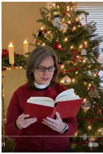
Christmas Eve Worship